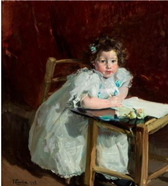
Joaquín Sorolla (Valencia 1863 – Madrid 1923)

Oil on canvas 90 x 83 cm; 35 3/8 x 32 5/8 in.